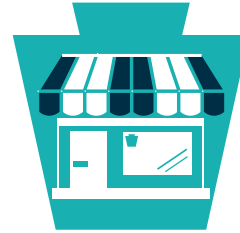
Existing Business Owner

These symbols are used to denote which sections are more useful for new entrepreneurs and which ones contain information geared toward existing business owners. Sections not designated by either icon contain information that is relevant for both types of entrepreneurs.